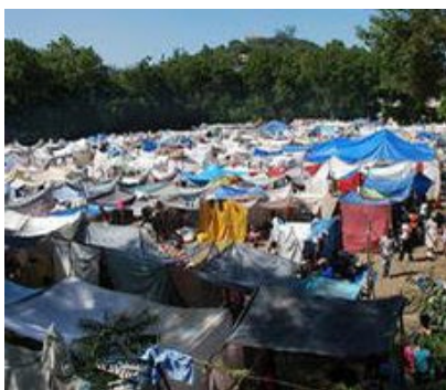
Refugee camp in Haiti